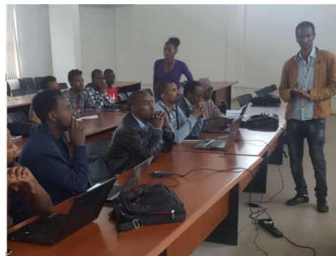
Training at Hawassa University

The training was held in collaboration with their Universities and this was done in order to improve the knowledge and skill of statisticians.